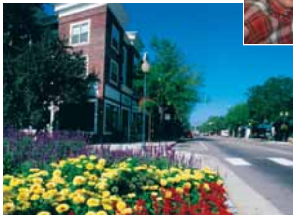
Littleton’s job base has grown from 15,000 to 30,000 over the last two decades and the sales tax base has grown from $6 to $20 million.

The learning curve that first decade was steep and occurring at three different scales: the entrepreneur at the micro scale, the politics of the local community at the mid-scale, and the strangeness of self-organizing economies at a large scale. By the late 1990’s, however, best practices were starting to emerge.