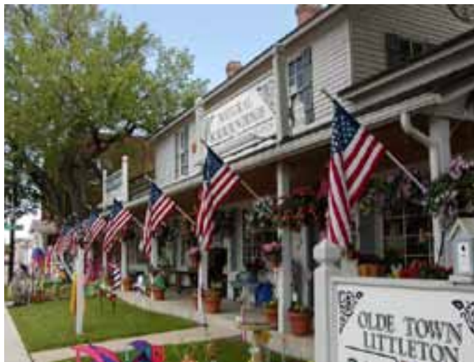
Entrance to downtown Littleton, Colorado

The Monty Python segue line seemed apropos to the birth of Economic Gardening. When the program was conceived in 1987, the idea that you could grow your own companies instead of recruiting them from other communities was such a radical departure from professional norms that there were no guidelines, no models, and no colleagues to discuss the idea. Such was the world