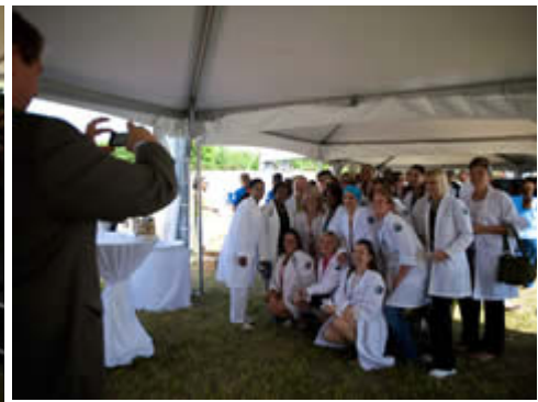
Over 300 people gathered to break ground for TCC's new center, including dozens of health professions students.